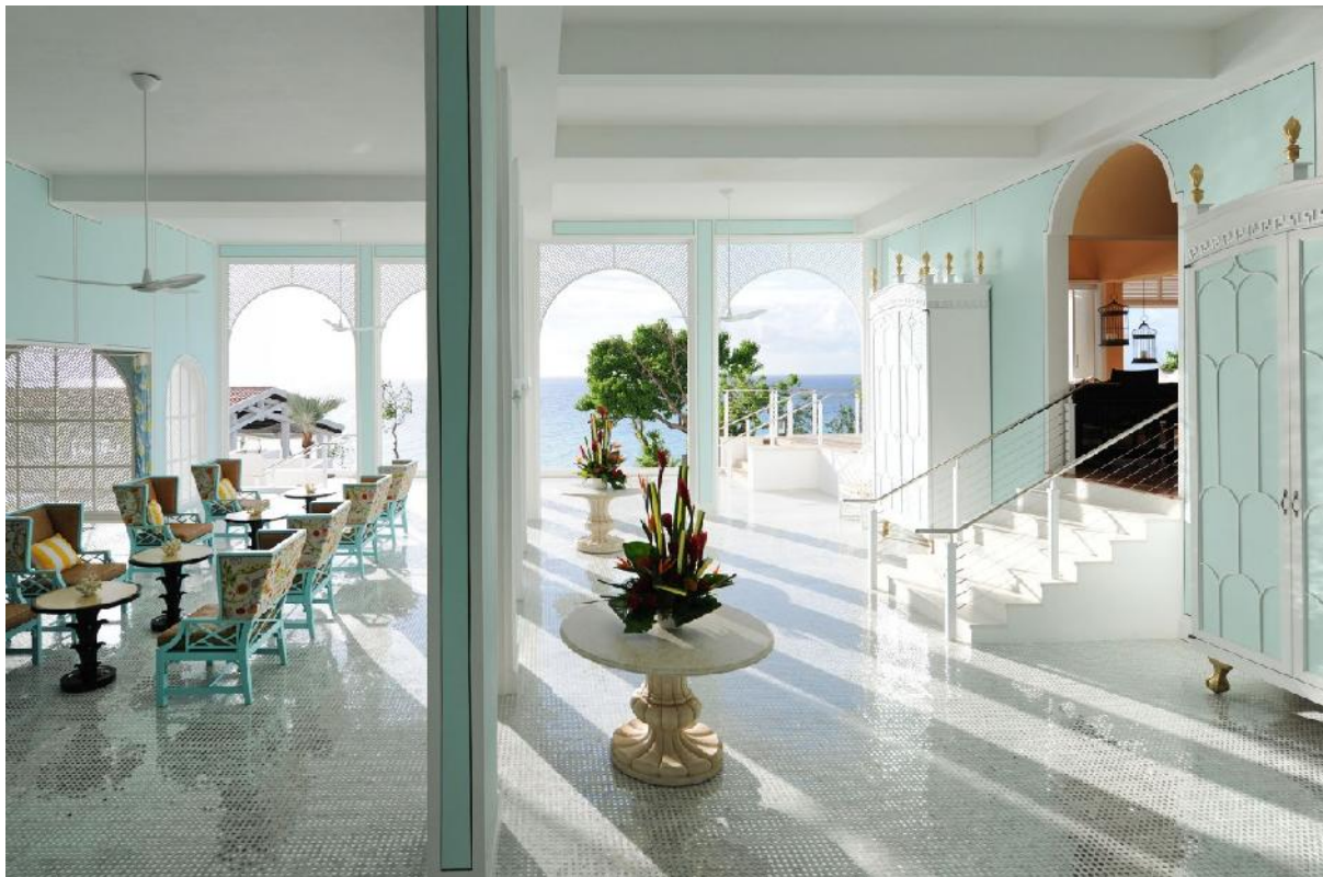
Malliouhana, An Auberge Resort, Anguilla

The Rat Pack Facial ($235; 75 minutes) The spa at The Ritz-Carlton, Rancho Mirage has it all: 15 treatment rooms, rain and Vichy showers and a eucalyptus-infused steam and sauna. When it comes to gifting, though, The Rat Pack Facial easily wins. Black diamond dust is the secret behind this gentlemen's facial, designed to gently exfoliate and maintain the complexion. A silt mask paves the way to a smooth complexion, just in time for the holidays.