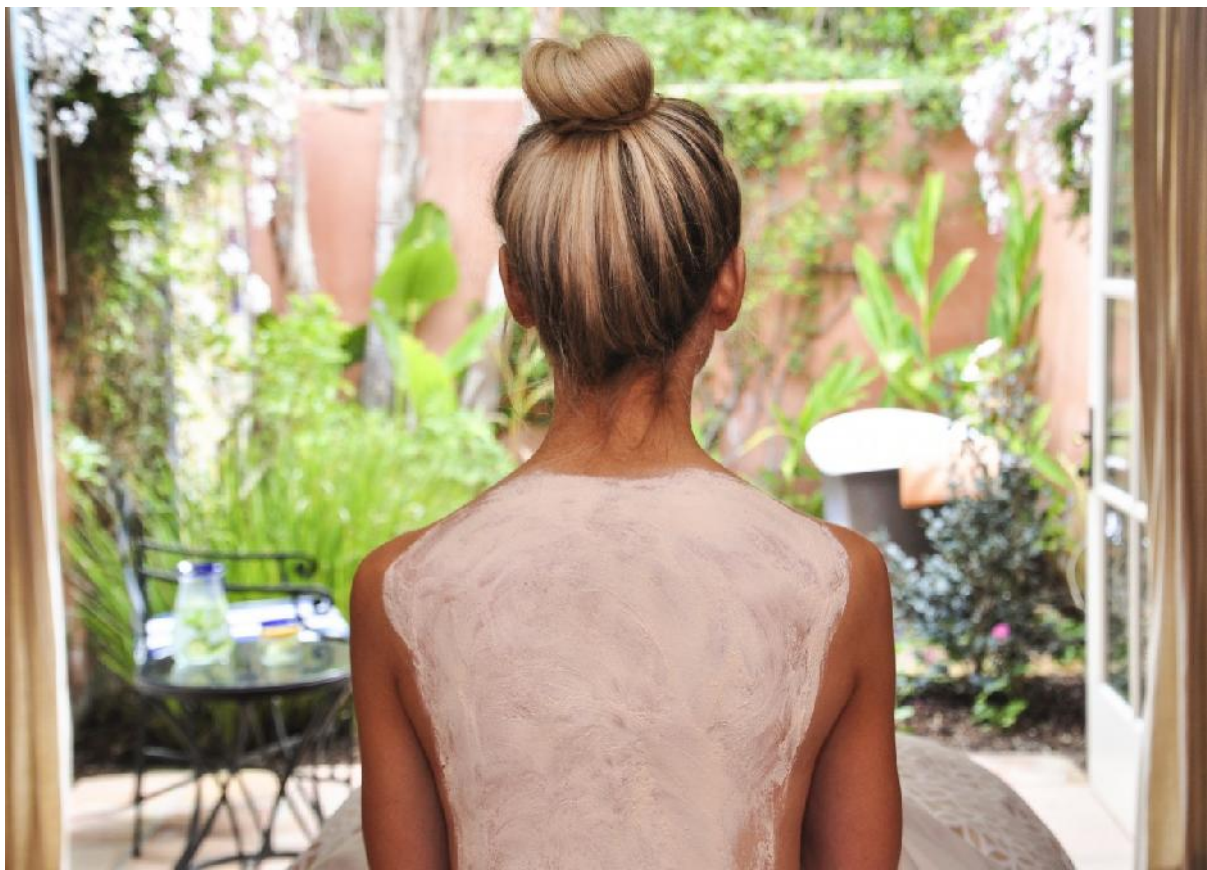
The Spa at Rancho Valencia, Rancho Santa Fe

Citrus Supreme ($425; 135 mins) Spanish skincare brand Natura Bissé is well-known for making some of the most luxuriously effective skincare on the market. Good news for fans of the line: The Spa at Rancho Valencia loves it too. The Citrus Supreme treatment for face and body—exfoliation, citrus soufflé mask, firming cream application and antioxidant facial—will leave you glowing and deliciously scented.