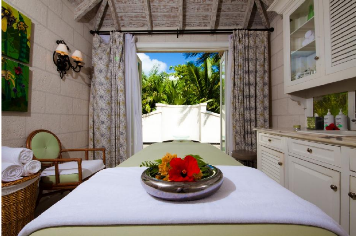
The Spa at The Palms Turks and Caicos, Providenciales

Warm Shell Massage ($225; 90 minutes) High over Meads Bay and Turtle Cove, it seems fitting that spa treatments should reflect the view below. The answer is the Warm Shell Massage, ideal after a game of golf or tennis on the property. Large shells filled with lava and saltwater generate their own, gentle heat. The therapist will combine these with a traditional massage, leaving you utterly relaxed.