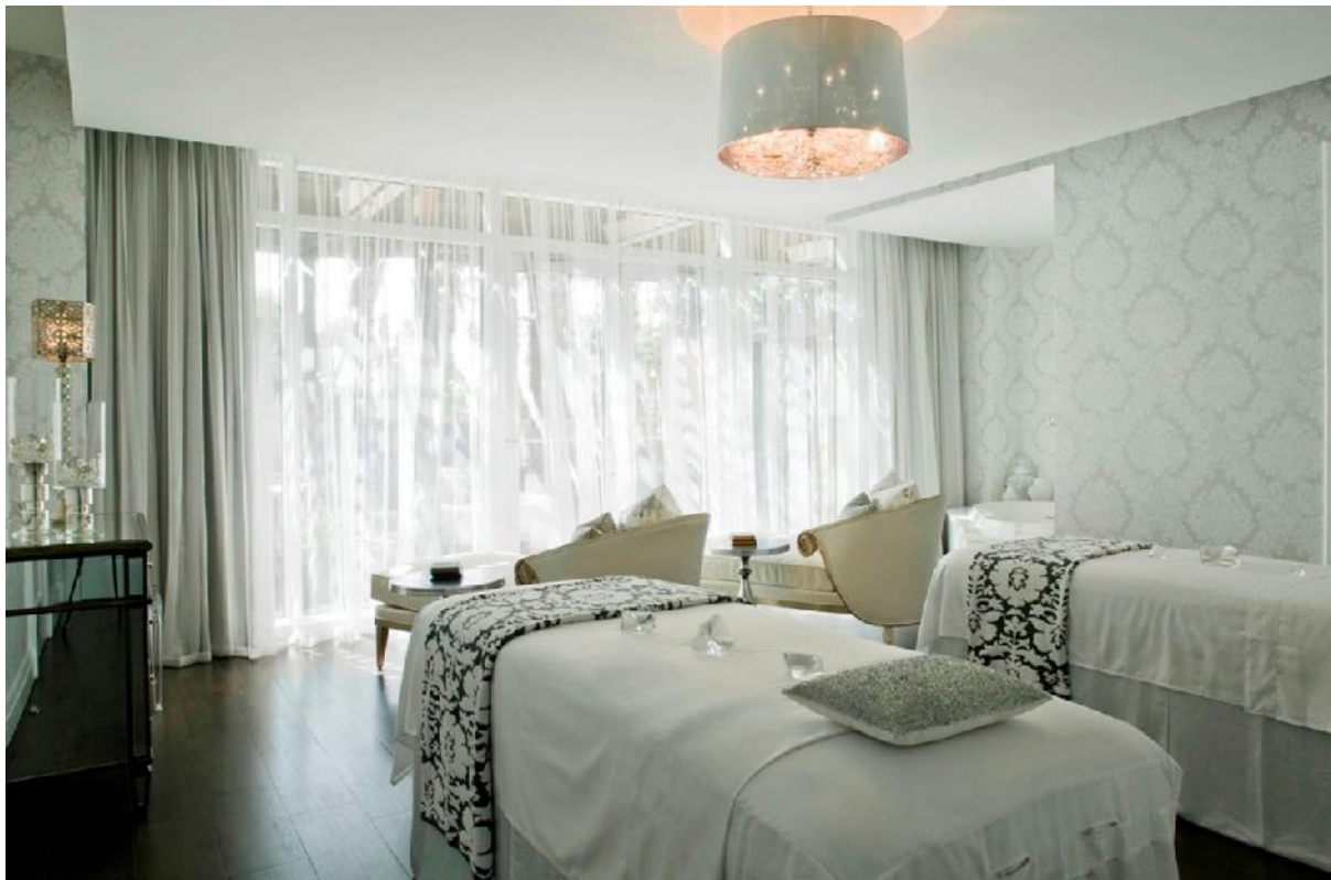
Eau Spa at Eau Palm Beach Resort & Spa, Manalapan

Citrus Supreme ($425; 135 mins) Spanish skincare brand Natura Bissé is well-known for making some of the most luxuriously effective skincare on the market. Good news for fans of the line: The Spa at Rancho Valencia loves it too. The Citrus Supreme treatment for face and body—exfoliation, citrus soufflé mask, firming cream application and antioxidant facial—will leave you glowing and deliciously scented.