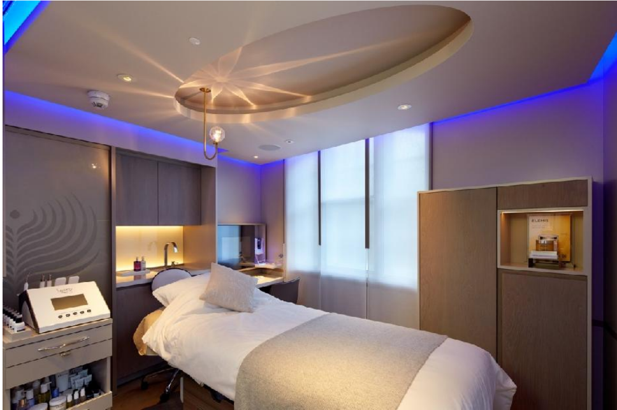
The House of Elemis, London

Red Flower Hammam ($295; 90 minutes) Eau Spa’s philosophy is “pause, play, perfect,” and guests can accomplish all three during the Red Flower Hammam treatment. You are submerged into a heated float bed, wrapped in a rhassoul clay cocoon, sprayed with orange quince mist and then covered in warm cardamom amber oil and tangerine fig butter crème (while massaged). There are also cupcakes and chilled champagne on hand—as well as lighting, aromatherapy and musical soundtracks customized to your exact specifications.