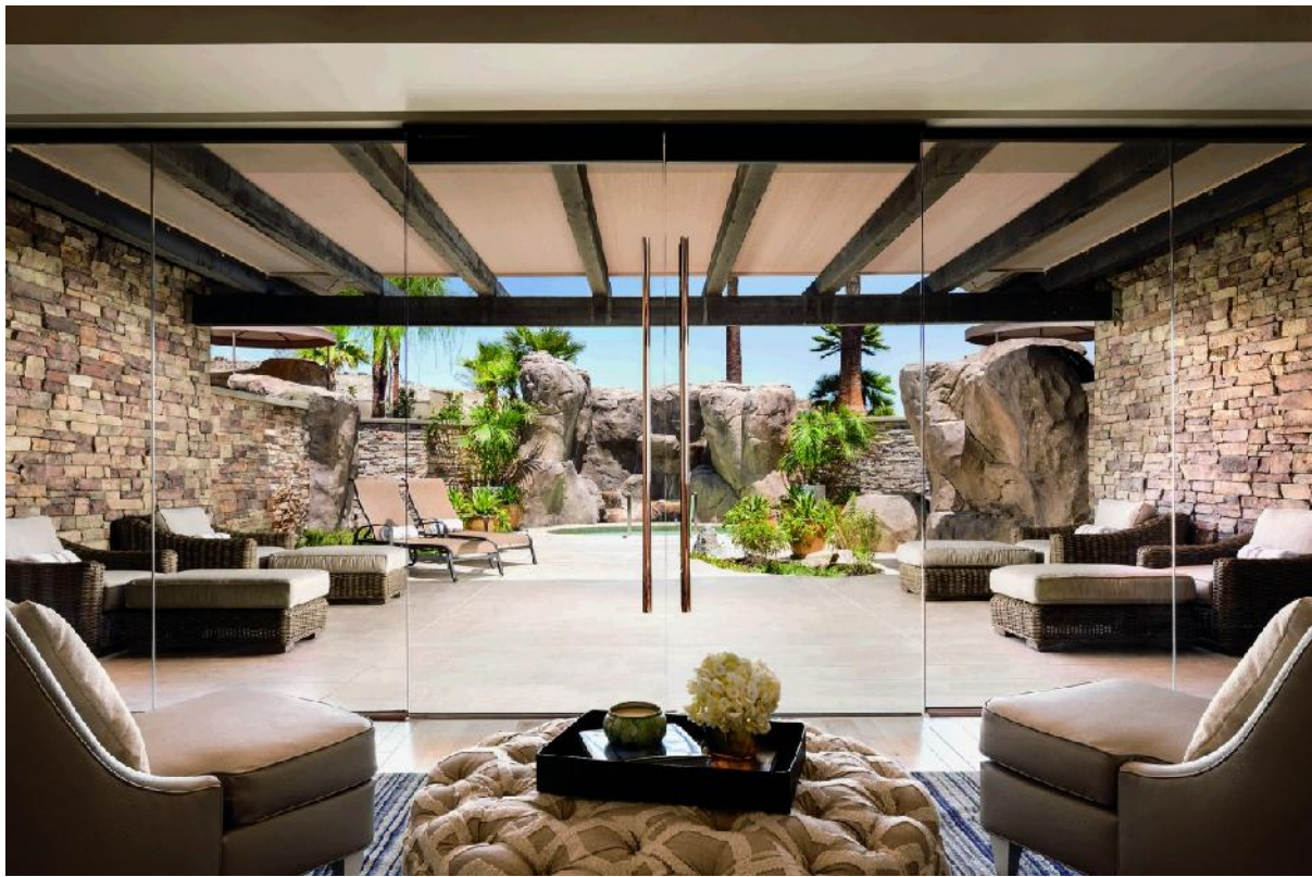
The Ritz-Carlton Spa at The Ritz-Carlton, Rancho Mirage

The Rat Pack Facial ($235; 75 minutes) The spa at The Ritz-Carlton, Rancho Mirage has it all: 15 treatment rooms, rain and Vichy showers and a eucalyptus-infused steam and sauna. When it comes to gifting, though, The Rat Pack Facial easily wins. Black diamond dust is the secret behind this gentlemen's facial, designed to gently exfoliate and maintain the complexion. A silt mask paves the way to a smooth complexion, just in time for the holidays.